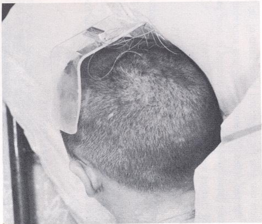
FIGURE XII-7 (left). Plastic headpiece and plug-in electrical connector, with electrode lead wires soldered to connector pins